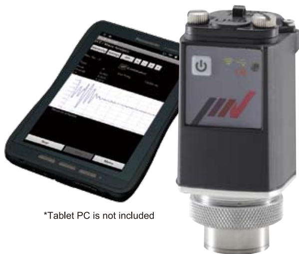
*Tablet PC is not included