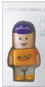
our original USB

Thank you for your increasing interest in IMV. IMV will be exhibiting at the forthcoming "Automotive Testing Expo 2013 Europe" and introducing products in our range. Our innovative product, ECO Shaker, Multi-point Vibration Test System and SAREX-UNO will be demonstrated on the stand and we are confident that you will see for yourself that the built-in, advanced technology is industry leading. Please visit our booth with this invitation card. You will get our original USB! We are looking forward to meeting you.