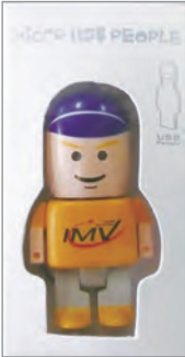
our original USB

Please visit our booth and get our original USB in darts game.